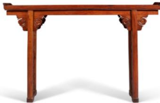
PROPERTY FROM THE ESTATE OF A LADY A HUANGHUALI TRESTLE-LEG TABLE 19TH CENTURY PRICE REALIZED: US$137,500 / HK$1,061,351