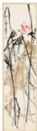
QI BAISHI (WITH SIGNATURE OF, 1863-1957) LOTUS WITH SEED PODS PRICE REALIZED: US$25,000 / HK$192,973