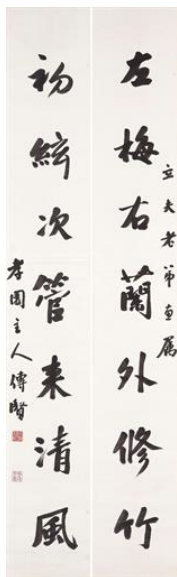
PROPERTY FROM THE FAMILY OF CHEN LIFU DAI JITAO (1891-1949) CALLIGRAPHIC COUPLET PRICE REALIZED: US$29,170 / HK$ 225,000