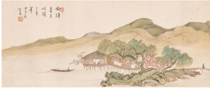
PU RU (1896-1963) WILLOW POND IN SPRING PRICE REALIZED: US$81,008 / HK$625,000