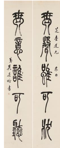
WU JINGLUE (1907-1987) CALLIGRAPHIC COUPLET IN SEAL SCRIPT PRICE REALIZED: US$72,908 / HK$562,500

Christie's Hong Kong online sale On Wings of Song: Chinese Paintings and Calligraphy from the Collection of Robert van Gulik (18 November to 2 December) achieved a total of US$777,033 / HK$5,995,000 with 100% sold by value, 96% sold by lot, and 500% hammer above low estimate. The top lot of the sale was Guo Morou (1892-1978), Couplet Calligraphy , which realized US$137,714 / HK$1,062,500, more than 8 times above pre-sale high estimate.