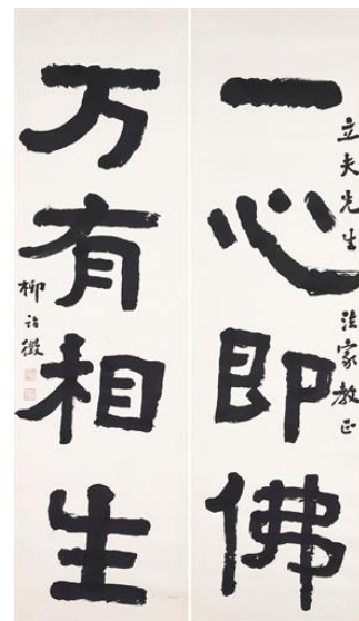
PROPERTY FROM THE FAMILY OF CHEN LIFU LIU YIZHENG (1880-1956) CALLIGRAPHIC COUPLET PRICE REALIZED: US$22,688 / HK$175,000