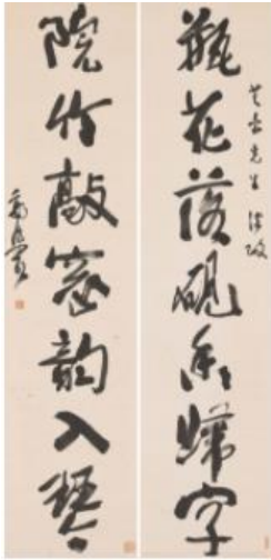
GUO MOROU (1892-1978) COUPLET CALLIGRAPHY PRICE REALIZED: US$137,714 / HK$1,062,500