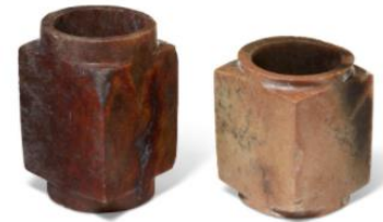
THE FLORENCE AND HERBERT IRVING COLLECTION TWO JADE CONG MING DYNASTY OR LATER PRICE REALIZED: US$68,750 / HK$530,675

Art of China Winter Edition online sale (18 November to 9 December) achieved a total of US$1,893,375 / HK$14,614,799 with 94% sold by lot, 100% sold by value, and 316% hammer above low estimate. The top lot was a huanghuali trestle-leg table from the 19 th century that sold for US$137,500 / HK$1,061,351, over six times its pre-sale estimate.