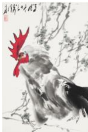
WANG ZIWU (B. 1936) ROOSTER AND PLUM BLOSSOMS PRICE REALIZED: US$32,500 / HK$250,865